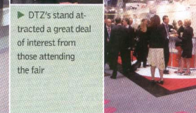
► DTZ's stand attracted a great deal of interest from those attending the fair