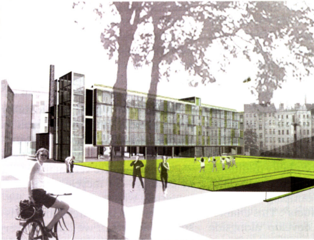
HOUSING AND SERVICE COMPLEX FOR WROCŁAW

Wrocław is currently one of the fastest developing cities in Poland. Somehow this process shows a general tendency in Central and Eastern Europe. Societies, lifestyle and therefore places are being changed. But there are still districts, where nothing has happened for many years. It is quite common, that where the surroundings stay in a bad condition, it has an equally bad or even devastating influence on the local society.